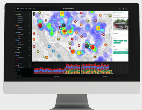
Figure 1: HVS can ingest a variety of event sources and IoT data.